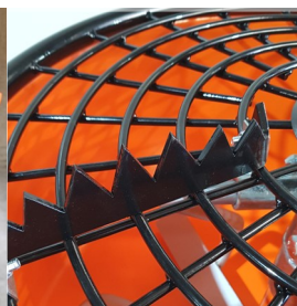
Serrated bag splitter (optional)