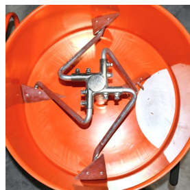
Four mixing arms and paddles