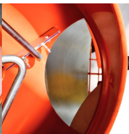
Extra wide chute